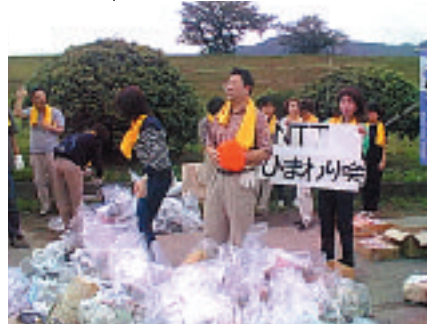
● Employees and their families participated in a post-summer vacation clean-up campaign for the Nagara River, in Gifu City, Gifu Prefecture, September 14, 2002.

In fiscal 2002, we launched a clean-up campaign for the Nagara river beds with the involvement of employees from the NTT WEST Gifu Branch and other group companies. Moreover, a total of 200 branch employees and their families including people affiliated with other group and cooperating companies also participated in cleaning up the city center of Morioka, under the leadership of younger employees of the NTT EAST Iwate Branch. The total number of participants nationwide in fiscal 2002 exceeded 20,000.