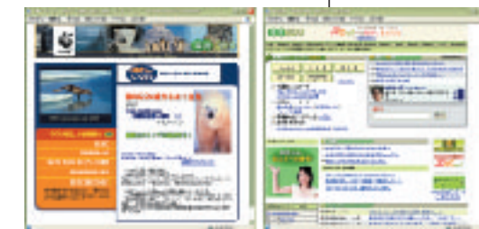
● Website with a "I will reduce CO 2 declaration" http://eco.goo.ne.jp/wwf-go4kyoto/

The Website offers a questionnaire survey and calculation of results of daily environmental activities so that we can see at a glance how the amount of CO 2 , a cause of global warming, can be reduced through individual efforts across the nation. As of the end of March 2003, a total of 109,937 people have "signed on" to the declaration on the Website.