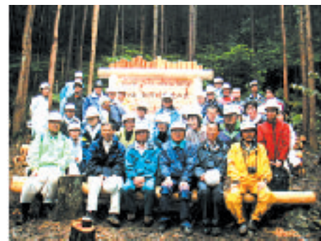
● Employees participated in tree planting, tree thinning, and the maintenance of hiking trails and bench making in the DoCoMo Tokigawa Sankyo Woods in Tokigawa Village, Saitama Prefecture, September 28, 2002.

In fiscal 2002, in addition to Aichi and Mie Prefectures, we sponsored project activities with the participation of 700 employees in ten areas including the Tokyo metropolitan area and nine prefectures over the Kanto and Koshinetsu regions to commemorate the 10th anniversary of NTT DoCoMo's establishment.