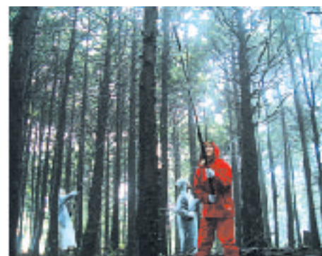
● Branch cutting in the DoCoMo Shikanoyama Woods in Atago National Forest in Futtsu City, Chiba Prefecture, September 28, 2002