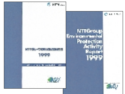
Photo 5.2-3 NTT Group Environmental Protection Activity Report 1999 (Japanese/English)

In December 1999, the NTT Group published its first official environmental report. NTT Group Environmental Protection Activity Report 1999 mainly highlights environmental protection activities undertaken during fiscal 1998.