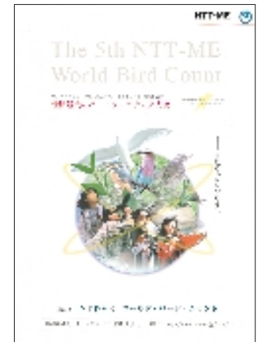
Photo 5.1-2 Poster for The 5th NTT-ME World Bird Count

An NTT Group website, Telecommunications in Symbiosis with the Earth—NTT Group , was launched in 1995. The content of this environmental site was entirely renewed to coincide with the publication of the NTT Group Environmental Protection Activity Report 1999 and the adoption of the NTT Group Global Environment Charter in 2000. The environmental website also provides information in English.