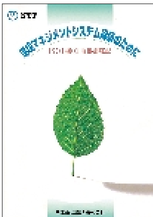
Photo 5.2-1 The Road to Establishment of Environmental Management Systems—Working Toward ISO Registration

Since August 1997, the NTT Group has worked on selection of model offices to promote the establishment of environmental management systems in compliance with ISO 14001 guidelines. The Road to Establishment of Environmental Management Systems—Working Toward ISO Registration , featuring case studies for the establishment of environmental management systems, on-going programs, the NTT Group's environmental protection activities, and other reference on environmental management systems, was compiled and distributed to all employees in June 1999.