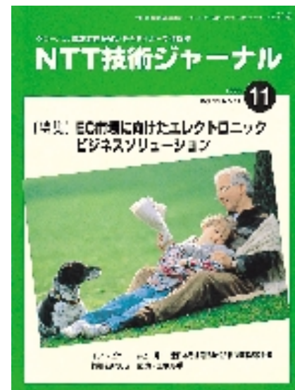
Photo 5.1-1 NTT Technology Journal