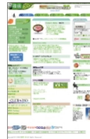
Fig.5.1-1 Top page of "kankyou-goo"