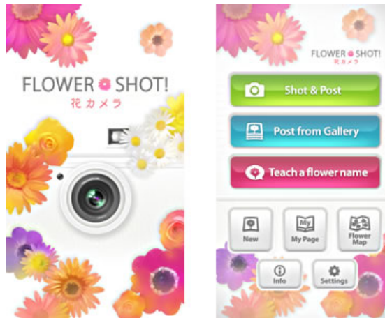
Smart Phone App Version

NTT now offers an English version of "Flower Shot" (smart phone app / online computer version) for overseas users. Language of "Flower Shot" is automatically selected according to the interface language. The online version for computers is also equipped with a function that allows language to be selected by each user (Japanese or English).